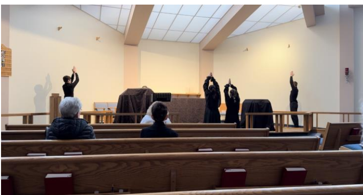
The Lord's Prayer Dance

Hope is hosting a garage sale at the end of April. You can start bringing things in on Monday, April 29 th at 8:30am. We will be giving all of the proceeds to the Olivet Mission. Olivet Mission provides services and programming for all ages. The Clothing Closet distributes free clothing and household items. They are located at 230 10 th St. N. W. All proceeds of the sale will be donated to Olivet. The sale will be on May 1 and 2 nd . Watch for more information as it is received.