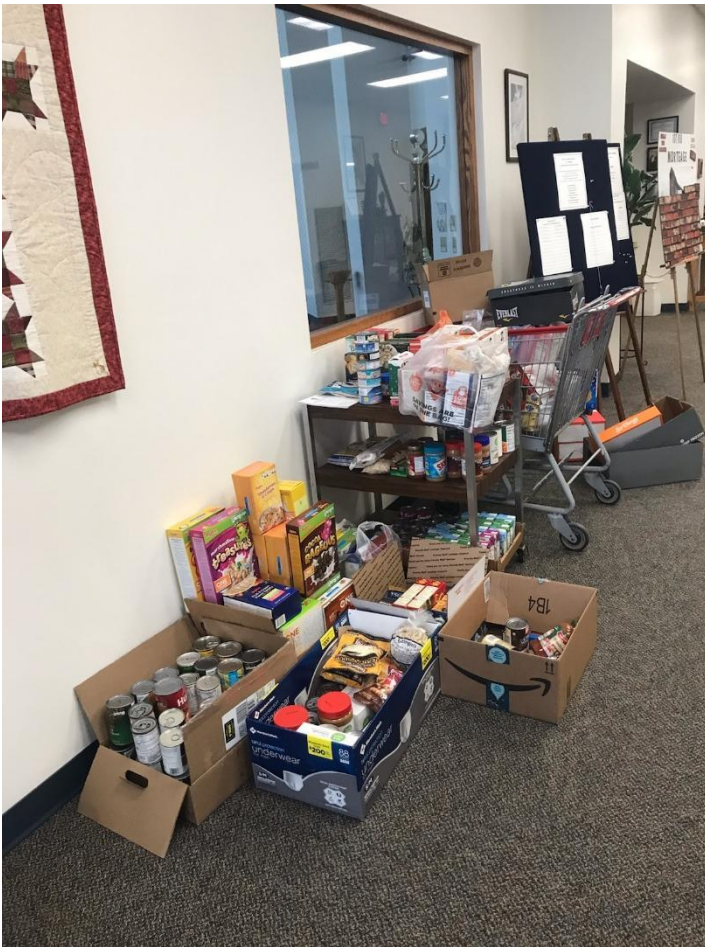
WOMEN OF HOPE FOOD BANK DRIVE

Thanks to everyone who contributed to the food drive sponsored by the Women of Hope.