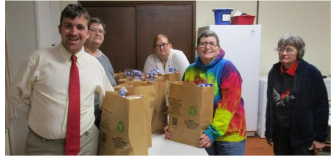
Bags of groceries for some who attend the Free Community Supper