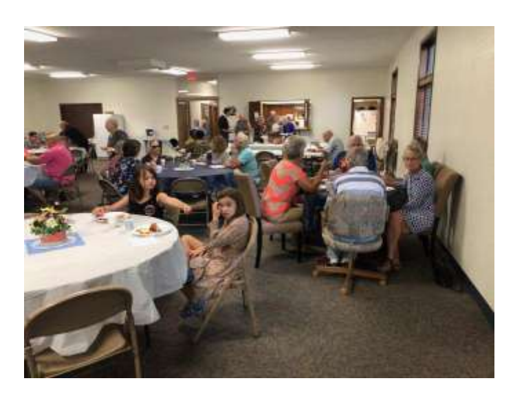
Reception after Installation