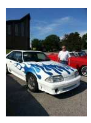
CAR CRUISE IN Outdoor Car Cruise is back! On Thursday, July 27, we will have our next Car Cruise in. Food service will begin at 5 with cars rolling in around 4pm.