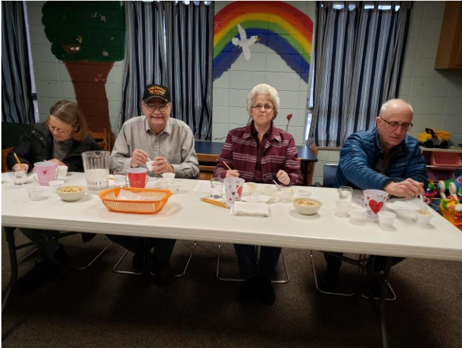
Our distinguished panel of judges.