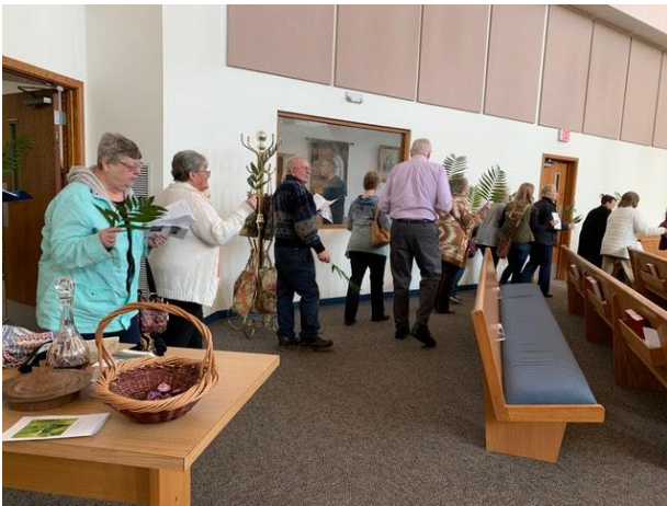
Palm Sunday – Procession of the Palms

Plants from Pierson's this year will be $6.75 . Checks MUST BE MADE TO PIERSONS . Deadline for ordering is Tuesday, May 15 TH . (Pentecost is May 28 TH this year.) Late orders will not be accepted at the office. You will have to order your own.